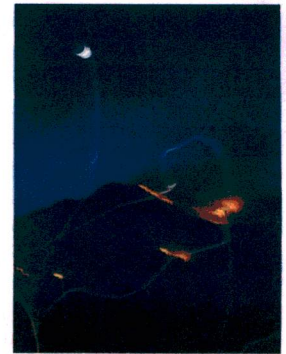
Moon over Murphy Fire in Beautiful Rio Rico, AZ

and hard work. And we are highly appreciative of the science and skill with which this potential disaster was managed.