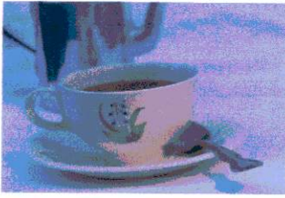
We'll put the coffee on.

"I'm very glad we came to the RORR potluck. I met some new friends and was surprised to run into and old friend, too!"