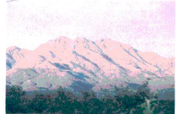
Beautiful Rio Rico, AZ

The intention is to address each of these ideas for action over the course of the year. The Board welcomes input from our members and from the Rio Rico community at large.